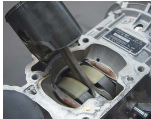
The pistons suffered only minor scuffing.