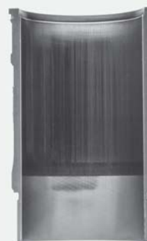
Severely Scuffed Liner