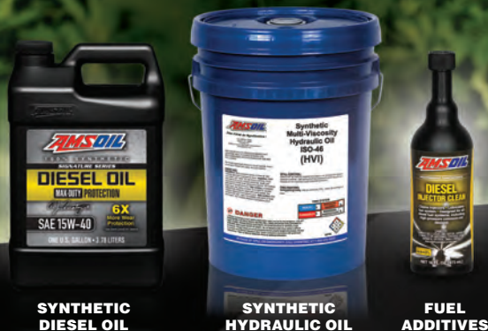
SYNTHETIC DIESEL OIL