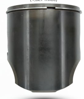
• NO PISTON RING STICKING • NO PISTON SCUFFING